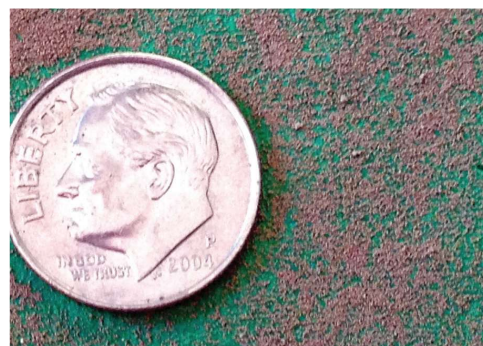
Photo shows Cosavet-DF Edge granule size. Each granule is comprised of thousands of particles averaging 2.5 microns in size.

The overall fine particle size provides a more concentrated surface area of sulfur, resulting in more and closer fungal and mite contact, more exposure to air for greater vapor action, and overall more intensive field area covered by a given application of sulfur.